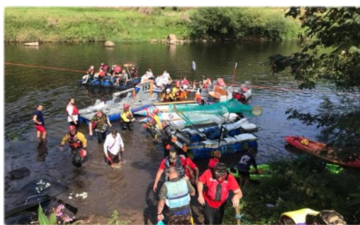
At the Monmouth Raft Race

And we were busy providing safety cover at the Monmouth Raft Race and the Severn Bridge Half-Marathon.