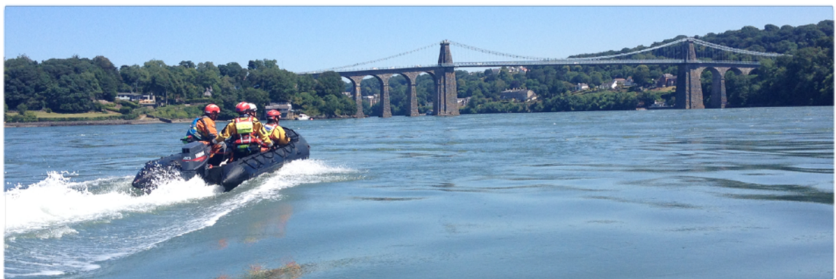
Swiftwater & Flood Rescue Boat Operator Training on the Menai Straits